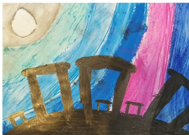
Amazing Stonehenge artwork created in Year 3 this week!

On Monday evening the Friends of Tannery Drift (FTDS) are holding their AGM; the meeting starts at 7.30pm and will take place at school. The Friends work hard throughout the year to organise a variety of fun events for Tannery Drift pupils and their families; these events support their fundraising efforts. Money raised by the Friends is used to support various projects and experiences for our children across the school. Fresh faces and ideas are always welcomed at the meetings and support at events is always well received! If you would like to find out more or offer your help please come along to the meeting.